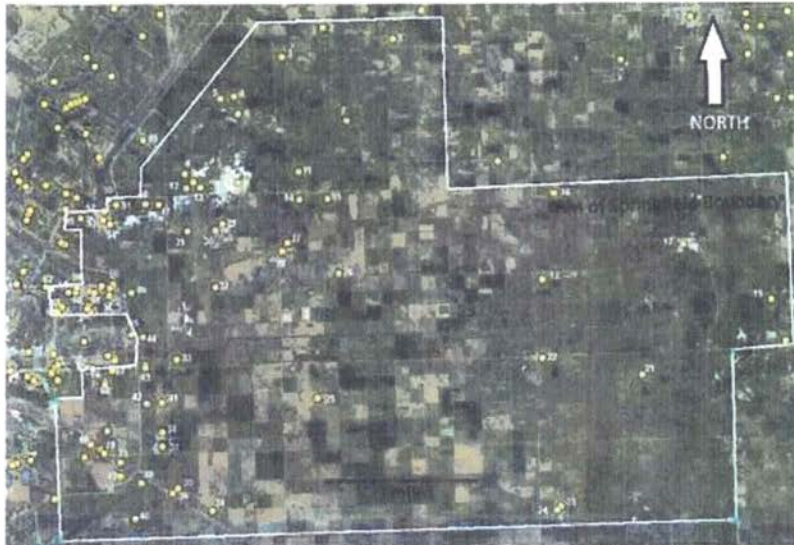
Figure 25 – License water use locations in the RM of Springfield region.